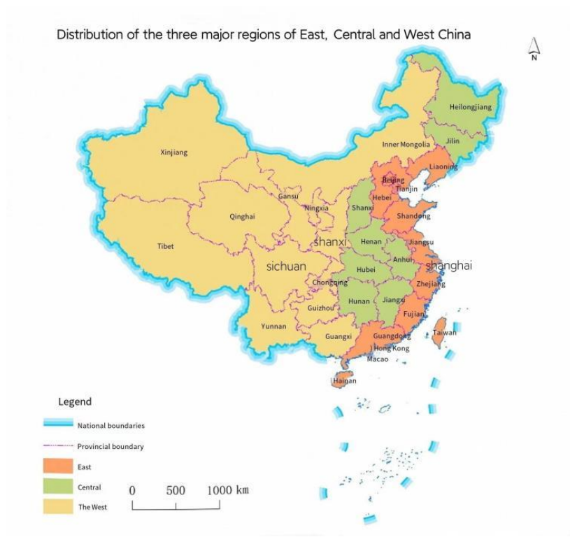
Figure 2. Distribution map of the three major regions of China.